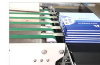
Auto book collector 自动收料