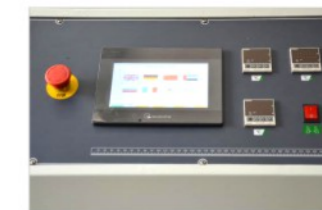
Individual control system 独立操作台