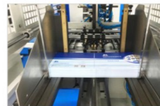
Auto Pushing Cases 自动推送书壳

MF-FAC390A 一拖二自动上壳压平压槽联动线是MF-FAC390的增速版。本机广泛应用于笔记本、绘本、相册、精装书籍等产品。本机采用飞达系统自动送壳兼有书背加热预压成型功能、自动套壳扶正压紧装置、自动压平压槽、自动收集成品，极大节省了人工成本；是精装书本生产的得力助手。