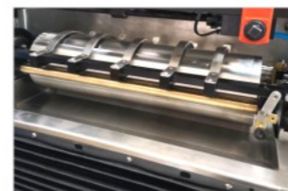
Double Gluing 双重上胶